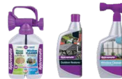
Dual System House Wash & Window Cleaner Outdoor Restorer Window Cleaner