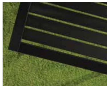
& More... Garden Decorations, Trash Cans, Storage Boxes, Sheds