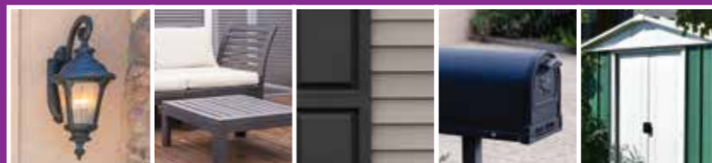
House Lights Patio Furniture Shutters/Vinyl Siding Mailboxes Sheds